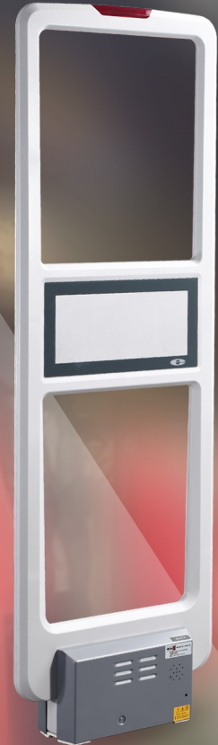
M6090-master M6090-slave 1550x520x127mm