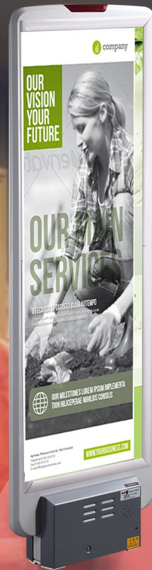
M6090-master M6090-slave Optional Ad panel